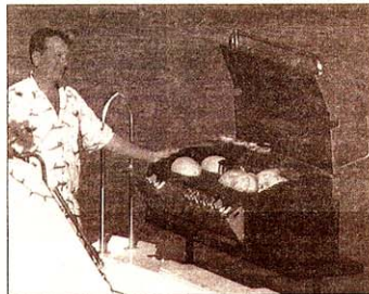
Islescapes features a grill mounted aboard the dinner cruise vessel.

For more information, call Islescapes at (305) 923-3319 or view the Web site at www.islescapes.com . rsilk@keysnews.com